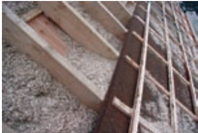
→ The most common domestic insulators, such as glass wool, mineral wool and foam, are industrially manufactured. And yet agriculture is a source of plant and animal-origin materials –hemp, coir, linen, felt, wool– that are just as efficient and less damaging. www.designinggreen.com