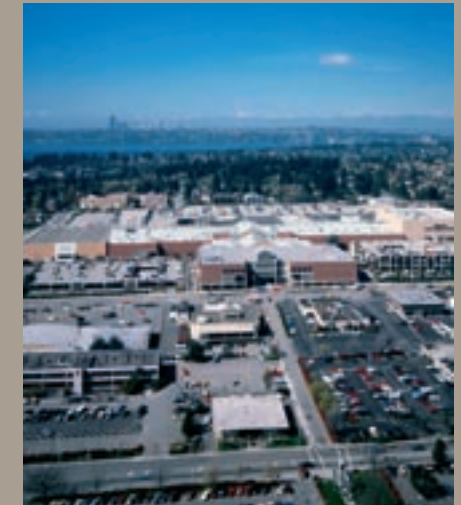
↓ Impermeable surfaces surrounding houses -frames, car parks, patios and roads- prevent rainwater from penetrating the ground. The result is increased incidences of flooding and runoff alongside depleted groundwater reserves.

Between now and 2025 the population is expected to grow by a third. The consequence will be an additional 2 billion people in need of shelter, workplaces and infrastructure. Building and maintaining these constructions will generate consumption of materials, but also water and energy. Furthermore, home ownership is tending towards ever more spacious individual houses, alongside a rise in the number of over-equipped second homes.