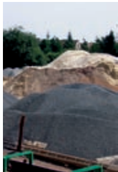
→It takes between 100 and 300 tonnes of gravel and sand to build a house.

www.tpsgc.gc.ca/rps/aes/content/ercr_handbook_appenda3-e.html